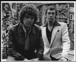
Thames Televisions 1980's fictional Spy's: "The Professionals" - disadvantaged by both available technology and dress sense

Clearly, unless you were a belonged to subversive organisation like the NUM or CND you probably were not being surveilled at the time by the security services, half of whom seemed to have been Oxbridge-educated Soviet agents anyway. The technology didn't exist for them to casually observe you, well maybe you - but not all of you- they had to "bug" you - physically putting a listening device in your receiver (how quaint) or actually follow you about, or sitting outside your house in a British Telecom van, continuously smoking Embassy No.1's in skin tight jeans with some headphones on over their permed hair. Or at least that's how it was done in the 1980's Thames Television program "The Professionals".